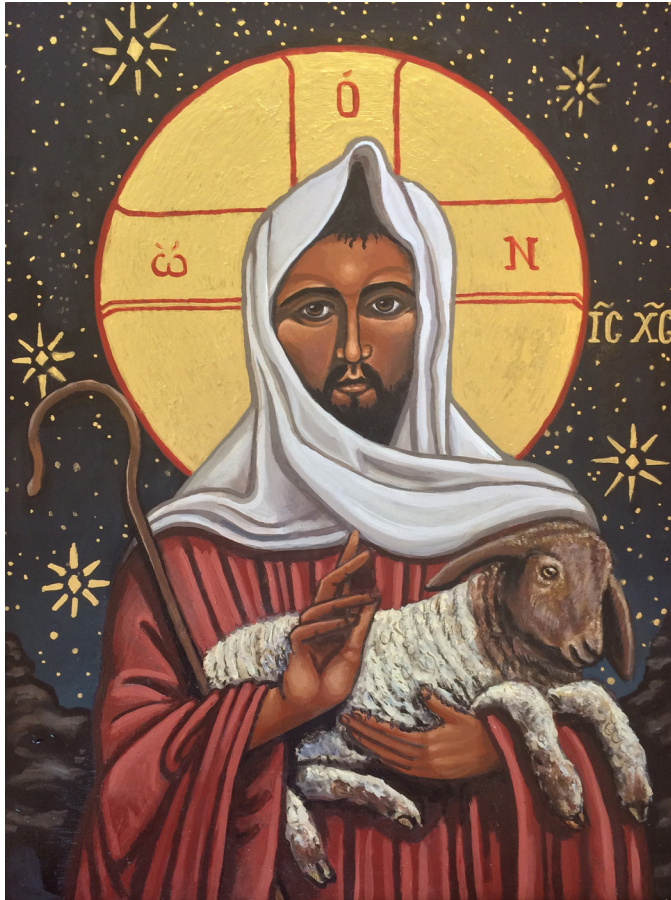
Good Shepherd, Kelly Latimore, 2019