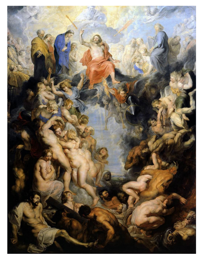
Last Judgment, Peter Paul Rubens, 1617