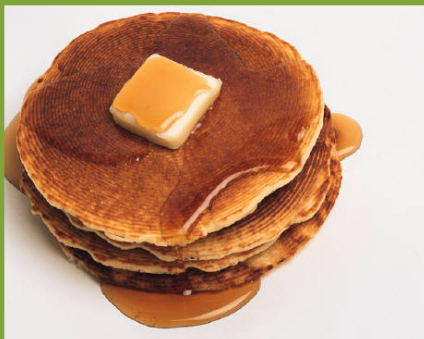
Did you know? "Shrove" isn't another word for breakfast-at-dinner. To shrive is to obtain absolution by way of confession and penance.

See page 7 for additional music program information.