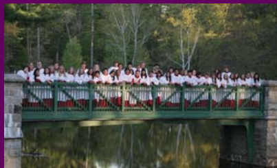
The Choir of St. Paul's School, Concord, New Hampshire