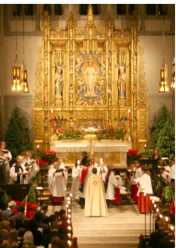
This is our home.